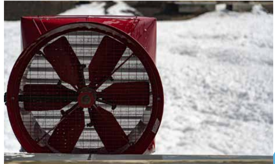
Annual flow testing and inspection of a foam suppression system