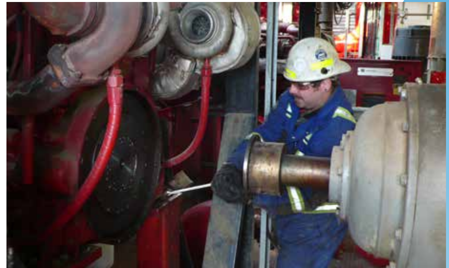
Installation of a fire water pump