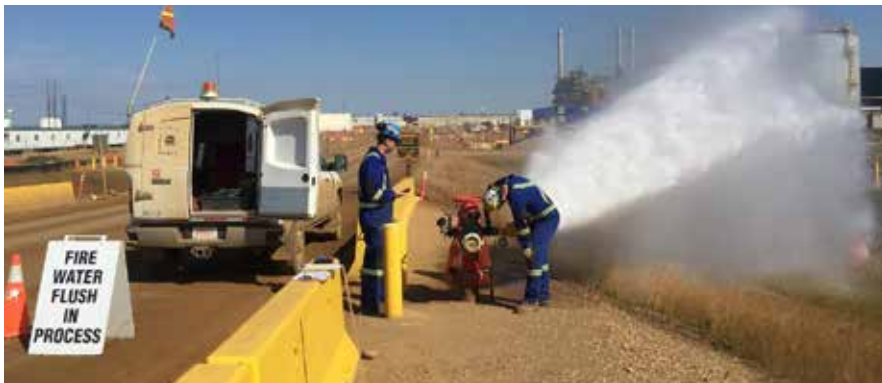
Hydrants Annual Flow testing and inspection

We are one of a handful of companies with ULC fire alarm testing certification within Alberta. Our designers and technicians have received manufacturer trainings on variety of suppression systems and are well versed in Alberta Building and Fire Codes as well as various NFPA and ULC Standards.